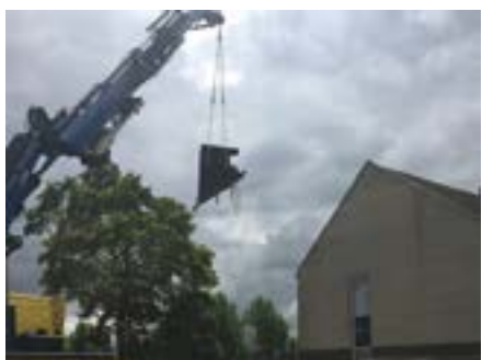
On request, the units are even supplied with lifting straps.