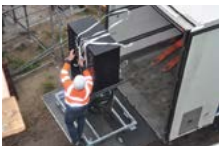
Unloading directly on the building site.