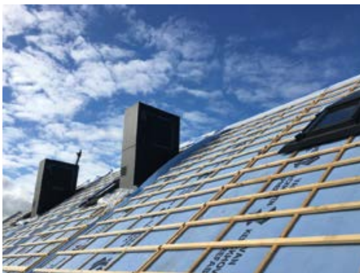
Roof upstand with roof pitch precisely tailored to 1°.