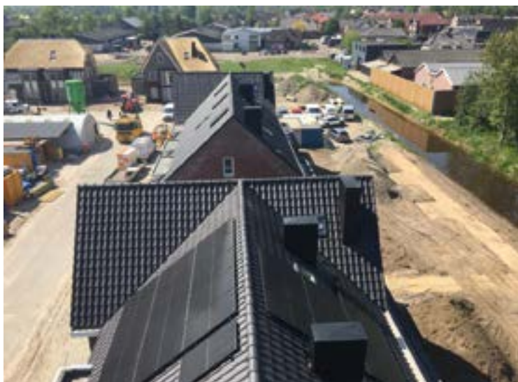
Combined with solar panels.