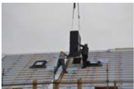
Finishing on the roof and connection indoors.