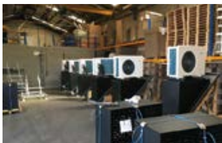
In our workshop heat pumps are being connected.