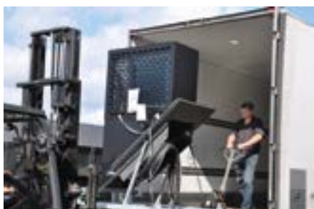
Loading the Prefab-units.